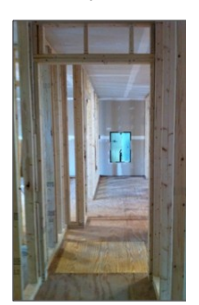
Looking through the length of the unfinished space.