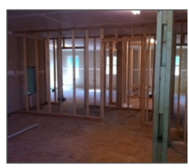
View of the 3 new client rooms.