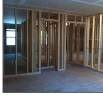
Client rooms from another perspective.