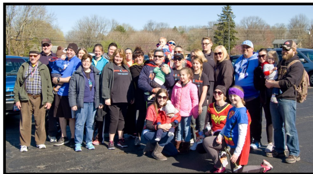
Members of the Jacob Alan Barker Foundation after completing the Superhero 5K .

Dayton Foundation Iddings Foundation Jacob Alan Barker Foundation Levin Foundation Reynolds and Reynolds Associate Foundation