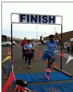
Walking to STOP Child Abuse

Nearly 150 participants were Walking to STOP Child Abuse for Child Abuse Prevention Month in April. In the picture to the left, a very happy runner crosses the finish line! Thanks to partners Greene County Children Services and the Xenia Chrome Divas for working together with us to raise over $3,000, and to Beavercreek High School for the use of their facilities.