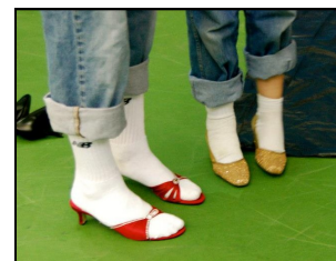
Walk a Mile in Her Shoes

It's been a busy spring, beginning with Walk a Mile in Her Shoes in February as part of Teen Dating Violence Awareness Month. Young men in Greene County donned women's high heels and walked a mile at Five Seasons Sports Club to raise awareness - and nearly $1,000 - in support of healthy relationships.