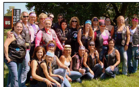
Xenia Chrome Divas

On a beautiful evening in May, the Beavercreek Golf Club played host to An Uncommon Affair . This signature fundraising event raised over $40,000 for much needed general operating support (the most difficult support to acquire) for FVPC! Thank you for your attendance and in-kind and financial contributions.