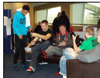
A few of the men getting sized for their heel-walking experience.