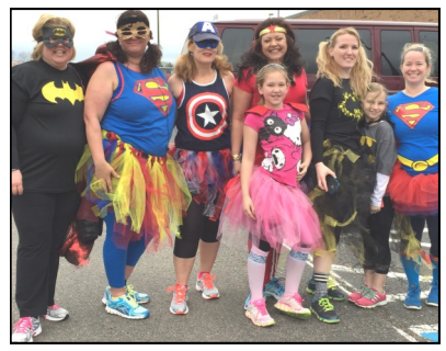
Group Costume winners received a gift card to a local restaurant.

On May 1, we were energized by the 180 special guests who attended our annual fundraiser, the "Uncommon Affair". The evening was hosted by our dedicated FVPC Board of Trustees. Guests enjoyed the company while competitively shopping at the silent and live auctions. It was a great pleasure to see longtime supporters as well as new friends. We are proud to share