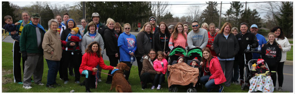
Members of the Jacob Alan Barker Foundation after completing the Superhero 5K

On Saturday, April 28th, hundreds of walkers and runners gathered at the Beavercreek High School for the Annual Superhero CAPE 5K Walk/Run. FVPC partnered with Michael's House, the Child Advocacy Center in Fairborn and both children-friendly service environments benefited from the donations. The mission of the run was to spread the message that child abuse is not ok, how to respond if you learn of child abuse and how to protect our children.